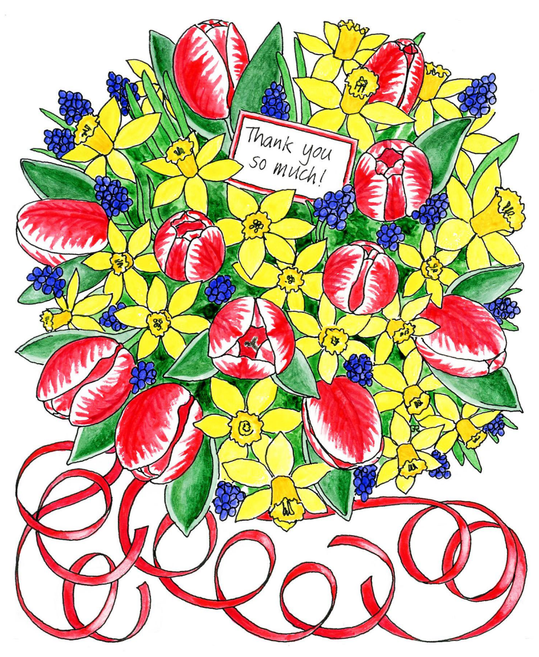
Mothering Sunday - 15 March